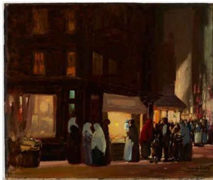
George Benjamin Luks (American, 1867–1933), Bleecker and Carmine Streets, New York , ca. 1905. Oil on canvas: 25 × 30 in.