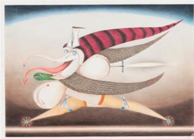
Images: Friedrich Schröder-Sonnenstern (German, b. Lithuania, 1892–1982), The Demoness of Urgency (Die Dämonin der Eile) , 1958. Crayon and colored pencil on paper. 25 × 35 in.

The Museum Café on the Café Level, under Windhover Hall, is open. The menu features snacks, salads, and sandwiches. Indulge in art-inspired beverages by Discourse: Coffee Workshop. The Kohl's Art Studio is open Friday–Sunday, 10am–4pm. Reserve your admission tickets and find information on parking, safety protocols, and more at mam.org/visit .