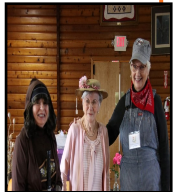
Yoda, Miss Minnie Pearl & the Conductor

NOV 15 ENUMCLAW GARDEN CLUB GENERAL MEETING AT THE VFW HALL. *a week early due to Thanksgiving Breakfast 4 the Birds tickets available for $25 or buy a table!