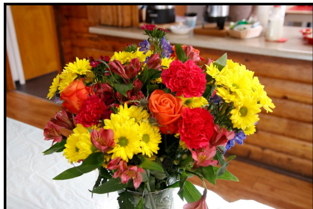
COLORFUL TABLE CENTERPIECE