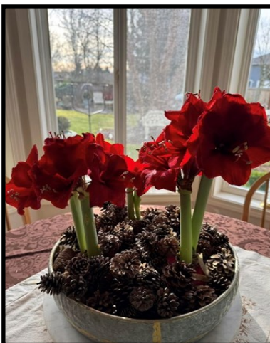
BEAUTIFUL AMARYLLIS SHARED ON FACBOOK.