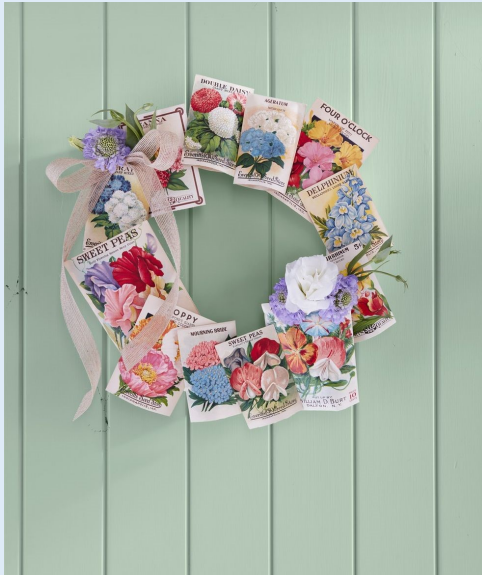
SEED PACKET WREATH

Give garden appeal to your home with a gorgeous hanging decoration, sourced from vintage seed packets. Simply attach 12 to 14 paper packets to a 12-inch foam wreath using straight pins. Add a few flowers into the display for the finishing touch.