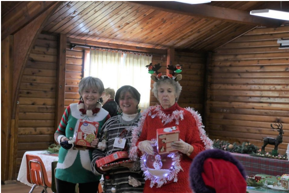
Sweater contest winners.....