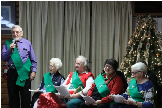
Xmas Choir entertainment