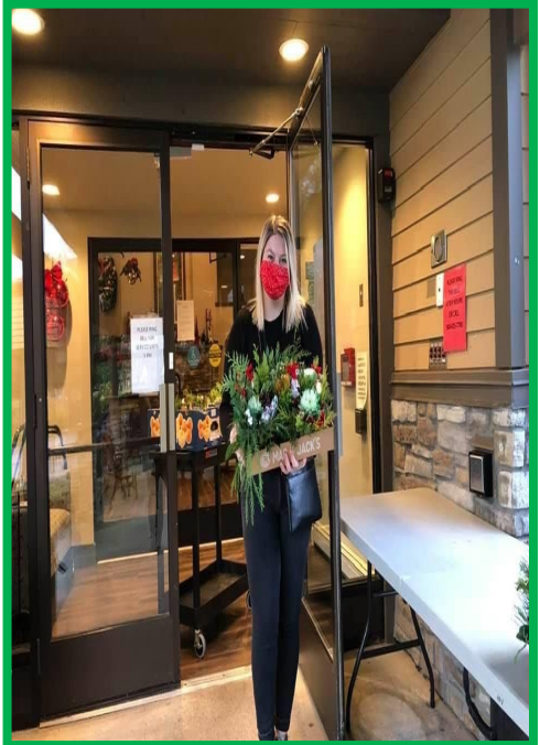
High Point Village

GARDENING TIP FROM MARIANNE BINETTI Hosta are slug magnets so I grow some in pots and use a bit of Worry Free pet safe bait and always remove the dead foliage in the fall to cut down on overwintering slug eggs. This is hosta Great Expectations and it has been in the same plastic pot (hidden inside clay pot and sitting on some bricks) for 5 years in Enumclaw, WA.