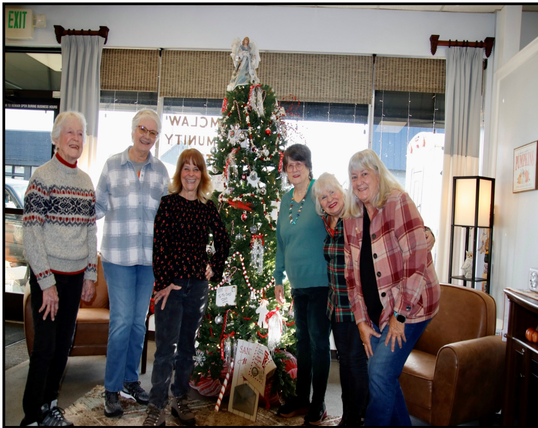
Christmas Tree decorated for the Senior Center.