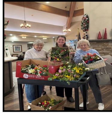
Centerpieces made & delivered to Cascade House & High Point.