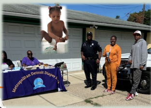
Metro Detroit Diapers