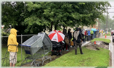
Rain or Shine