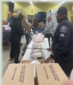
Appreciate our Lending Hands