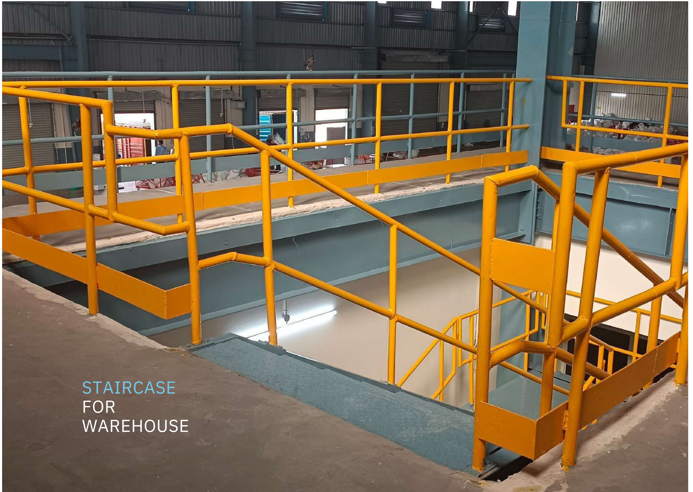
STAIRCASE FOR WAREHOUSE