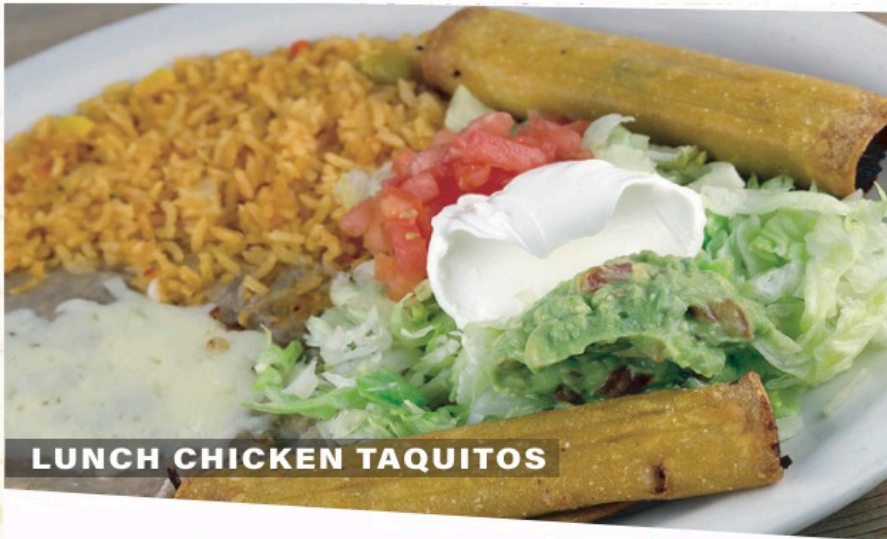
LUNCH CHICKEN TAQUITOS