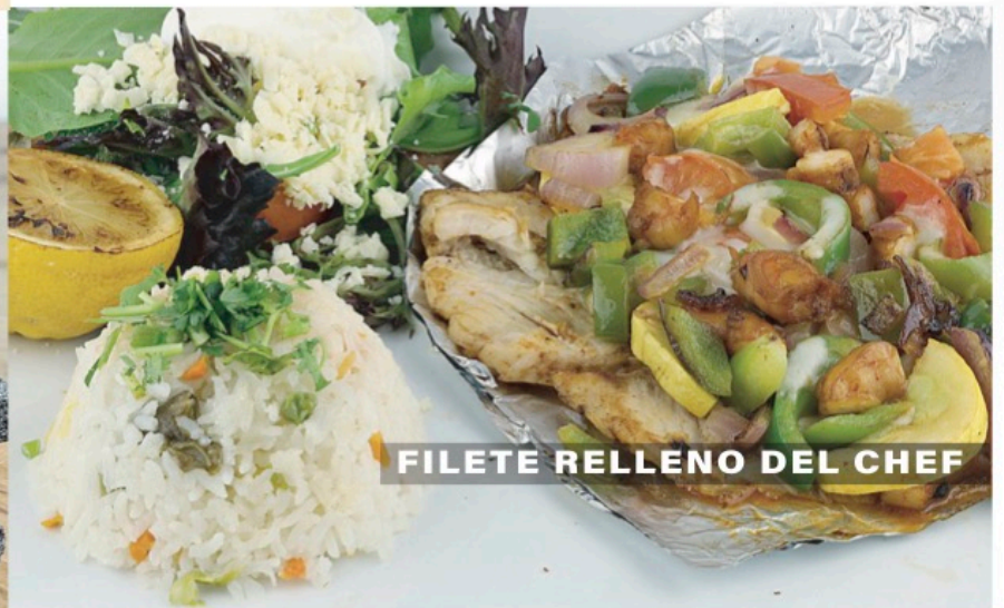
FILETE RELLENO DEL CHEF

*Consuming raw or undercooked meats, poultry, seafood, shellfish or eggs may increase your risk of food borne illness.