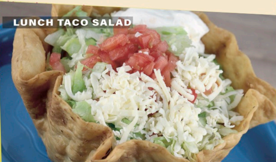
LUNCH TACO SALAD