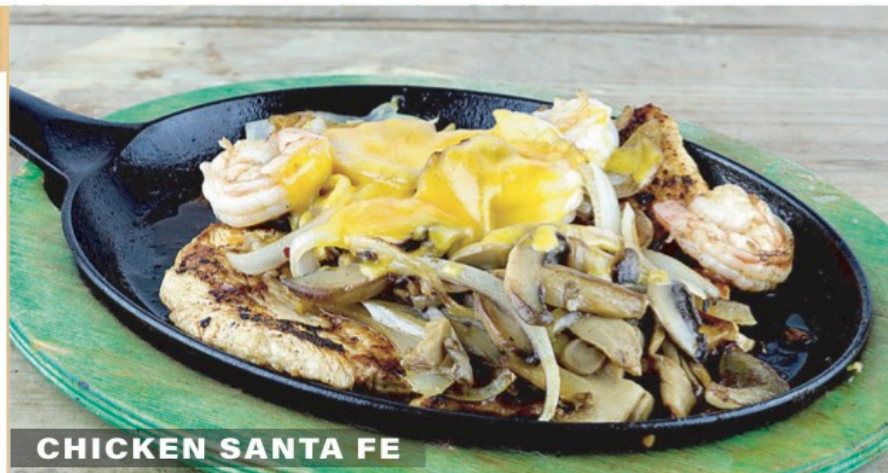
CHICKEN SANTA FE