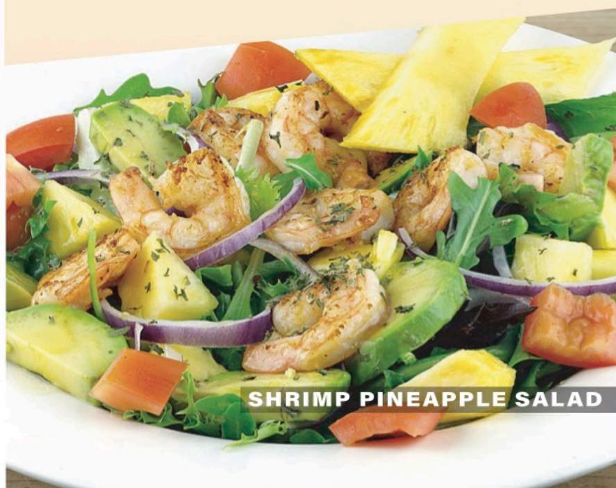
SHRIMP PINEAPPLE SALAD

*Consuming raw or undercooked meats, poultry, seafood, shellfish or eggs may increase your risk of food borne illness.