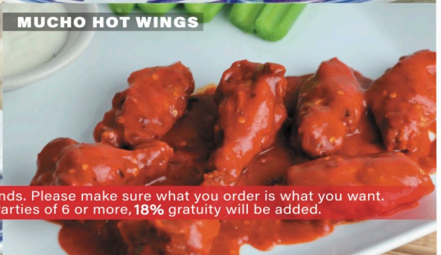
MUCHO HOT WINGS

All sales are final. We don't take food back or give refunds. Please make sure what you order is what you want. Not responsible for any left or lost items. • Parties of 6 or more, 18% gratuity will be added.