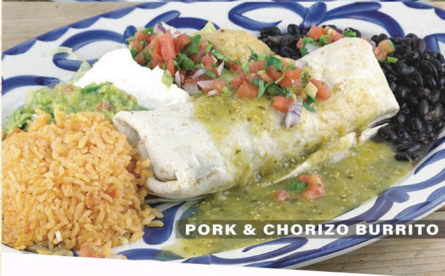
PORK & CHORIZO BURRITO