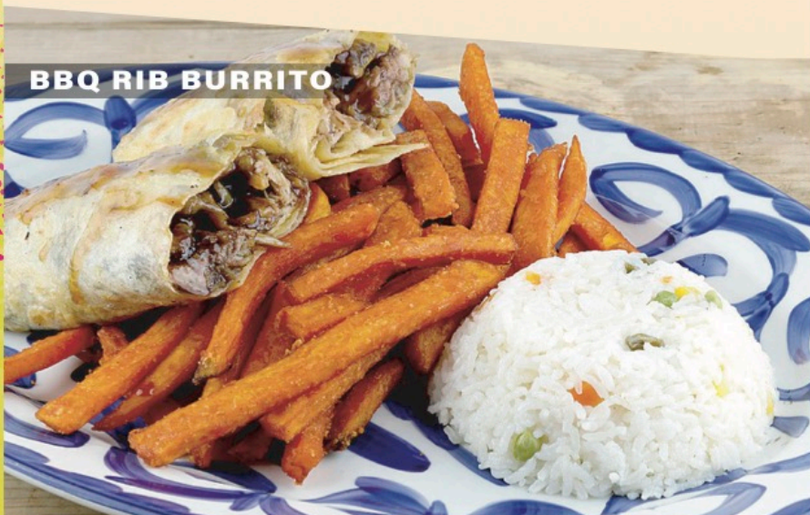
BBQ RIB BURRITO

*Consuming raw or undercooked meats, poultry, seafood, shellfish or eggs may increase your risk of food borne illness.