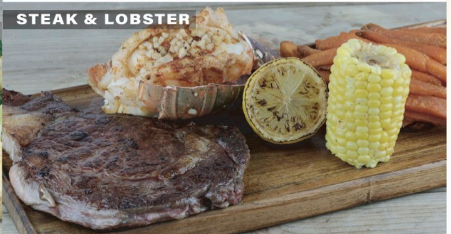
STEAK & LOBSTER

T-bone with 2 eggs. Served with loaded fries topped with jalapeno, pico de gallo, sour cream, guacamole and white queso. 24.99