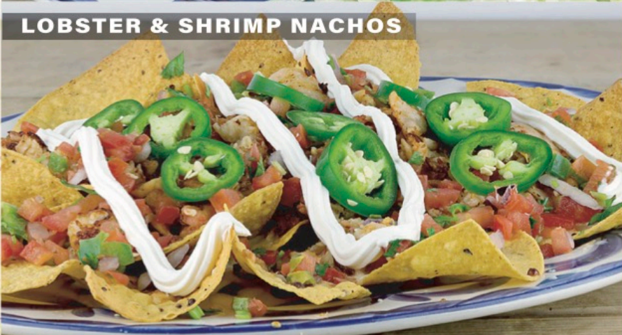
LOBSTER & SHRIMP NACHOS