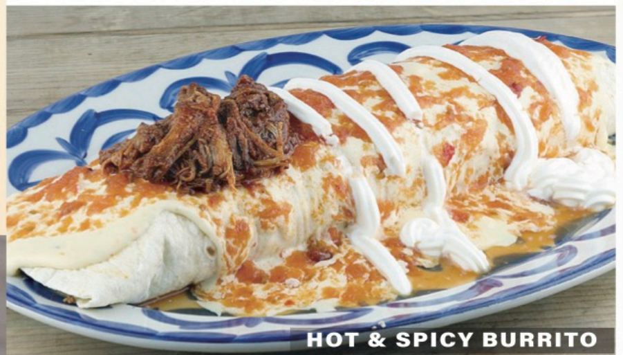
HOT & SPICY BURRITO

Covered with white queso sauce and served with Mexican rice and sour cream salad. 13.99