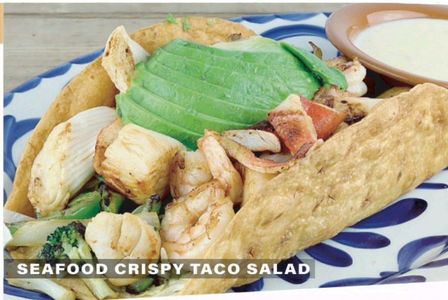
SEAFOOD CRISPY TACO SALAD