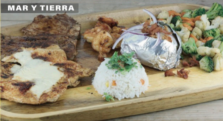
MAR Y TIERRA