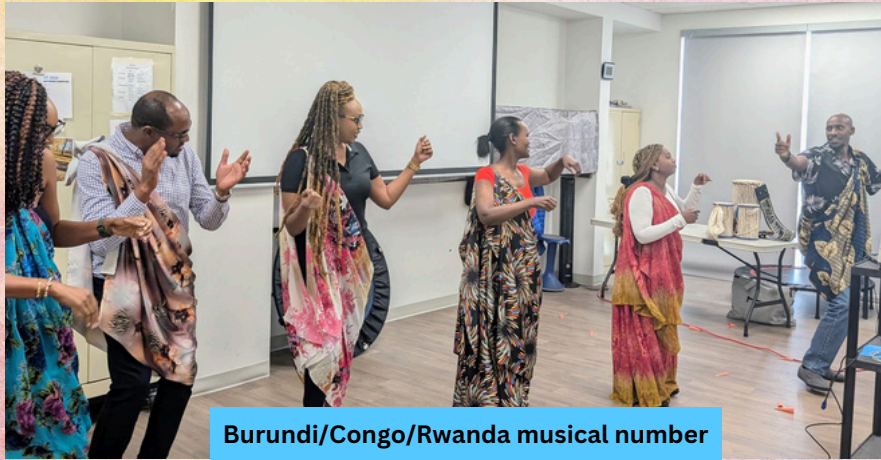
Burundi/Congo/Rwanda musical number