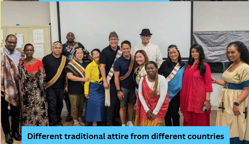
Different traditional attire from different countries