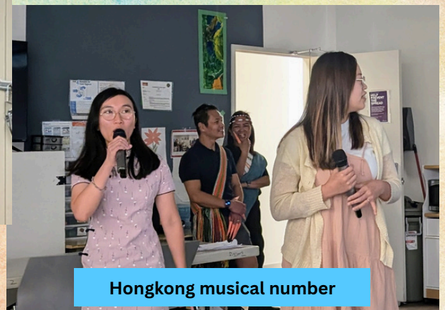
Hongkong musical number