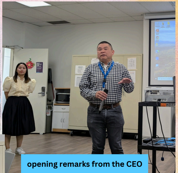
opening remarks from the CEO