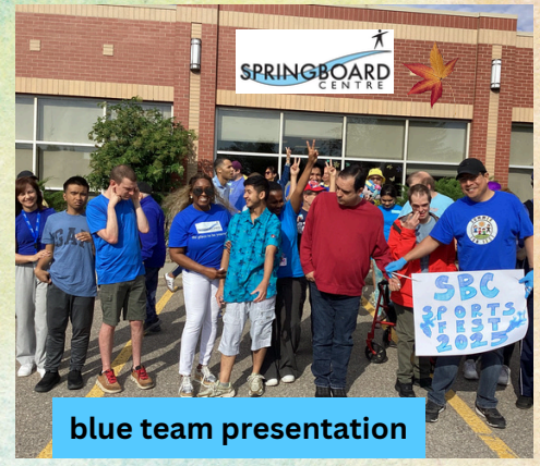
blue team presentation