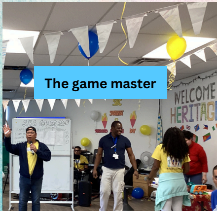
The game master