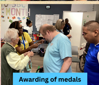
Awarding of medals