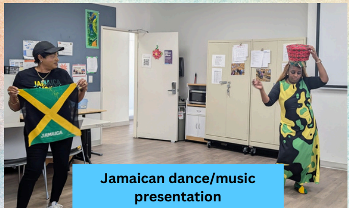
Jamaican dance/music presentation