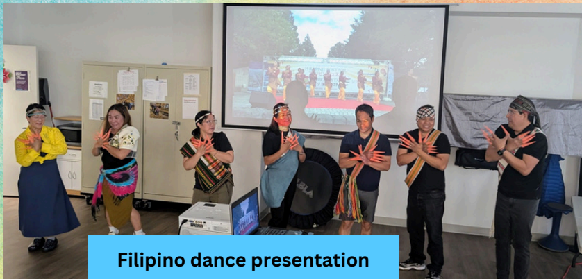
Filipino dance presentation