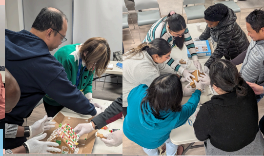
Staff ginger bread house making contest