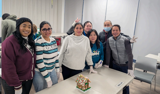
Santa came to SBC December 17, 2025