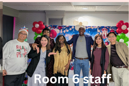
Room 6 staff