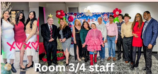
Room 3/4 staff