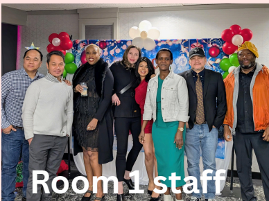
Room 1 staff

STAFF HOLIDAY PARTY! KUDOS TO THE WWC GROUP FOR ORGANIZING SUCH AN AMAZING HOLIDAY PARTY!