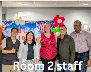
Room 2 staff