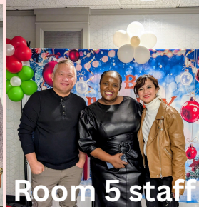
Room 5 staff