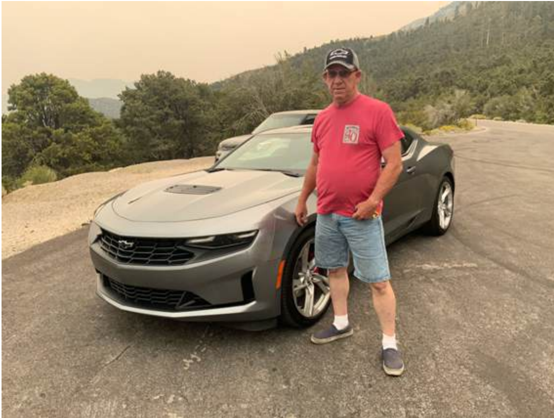
Owned by: Bill Ramsey 2020 Chevrolet Camaro 2SS LT-1