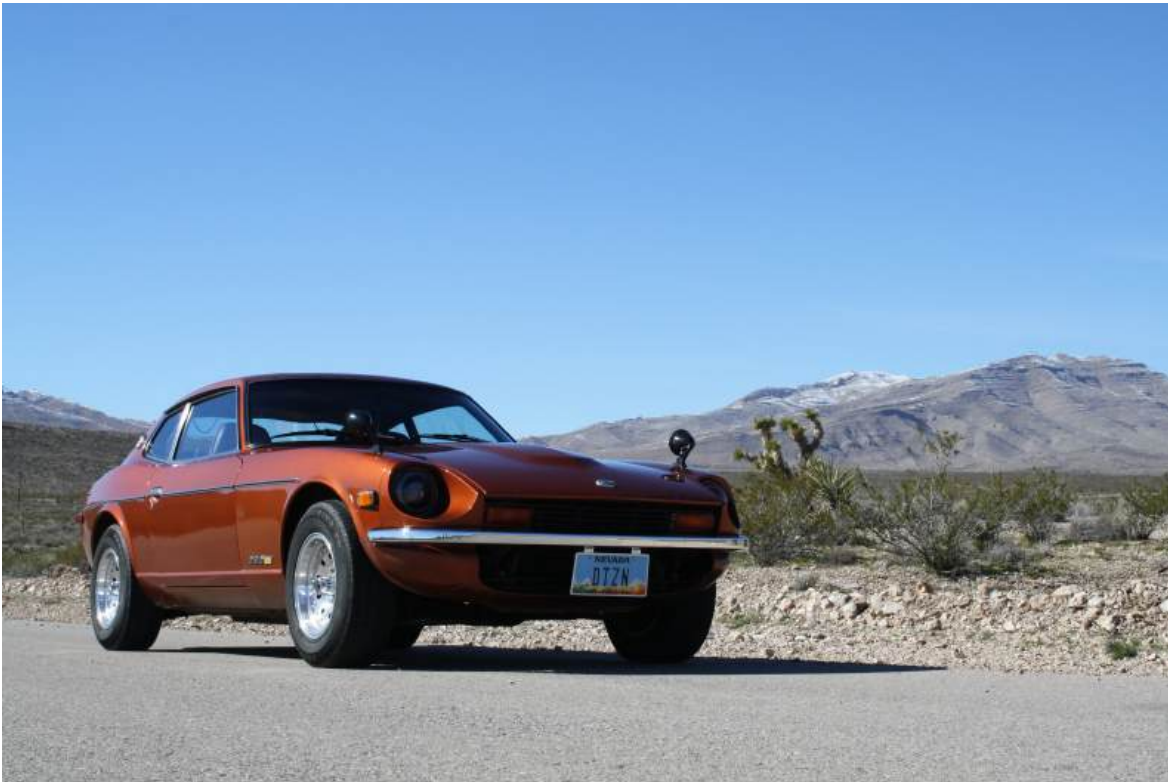
1976 Datsun 280Z 2+2 Owned by: Conner Murphy