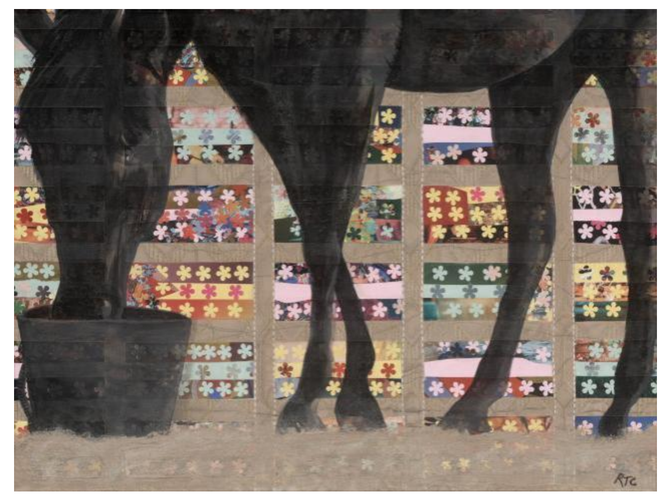
30 \times 40 , paper & acrylic on canvas.