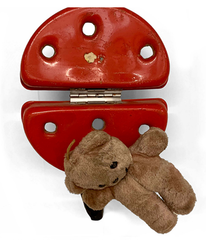
Untitled, by Hawkins Bolden. Photograph by Kathy Johnson Bowles

Each piece, exquisitely displayed like a sacred relic against a clean white wall, reads like a homage to Bolden. Some pieces are displayed like a single masterpiece on a wall, such as with a worn, gray metal trash can lid with raised concentric circles, punctuated with holes and pieces of cobalt blue shag carpet. Elsewhere a series of Bolden's scarecrows seem to march across a platform as if in the midst of a ritual.