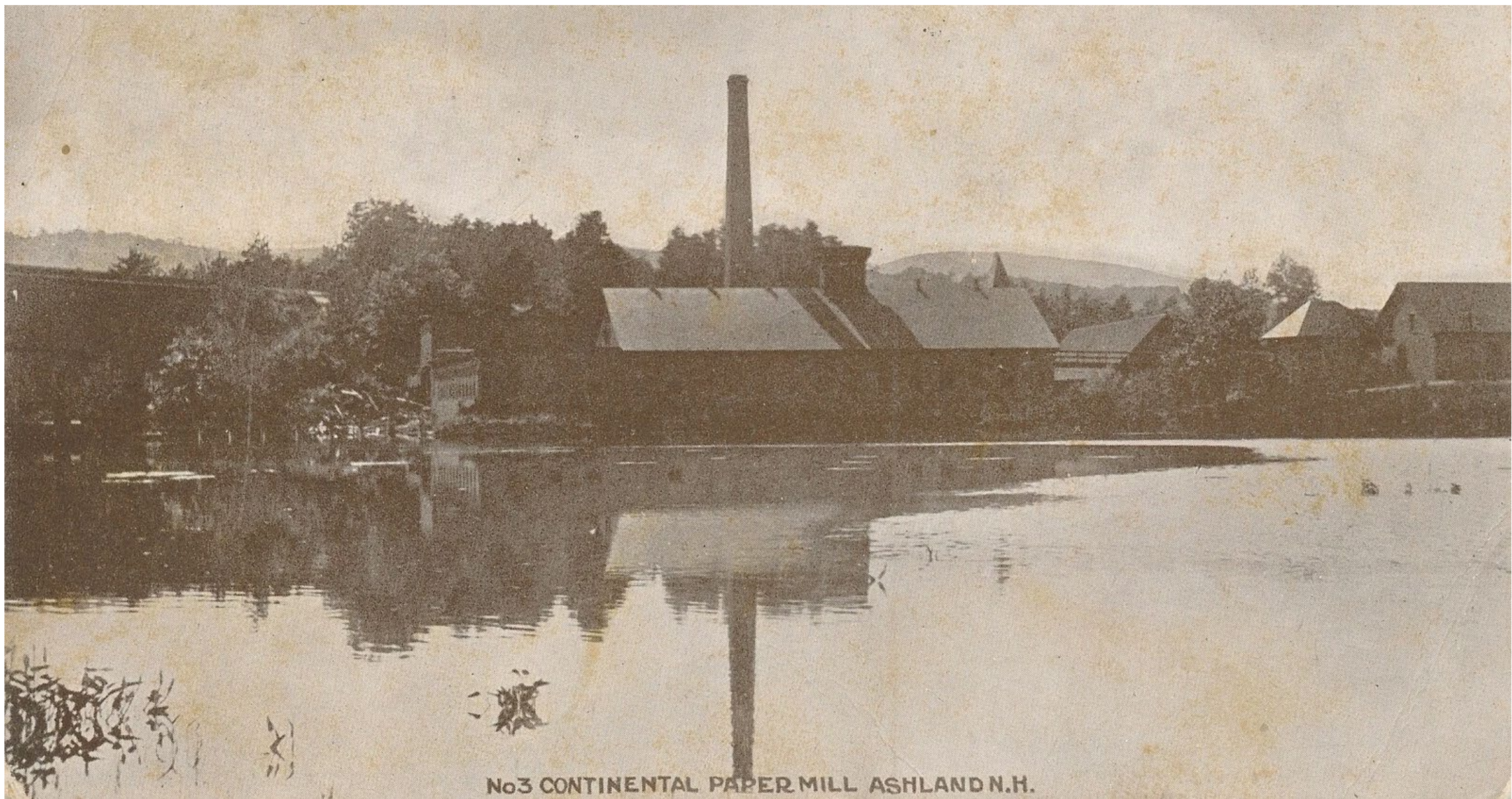
No 3 CONTINENTAL PAPER MILL ASHLAND N.H.