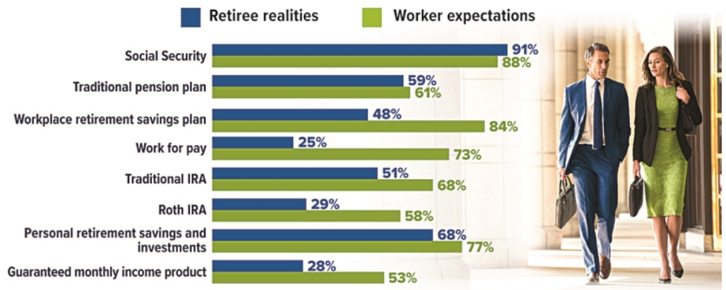
Worker expectations for retirement income vs. retirees' actual experience