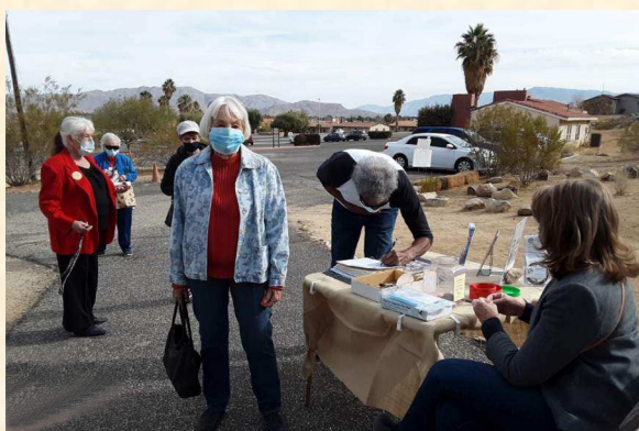
MHS members socially distancing and registering for the January 2021 meeting and the 2021 MHS Officers Oath of Office ceremony.