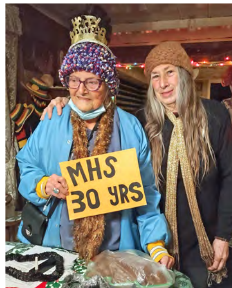
The Queen Mary celebrates 30 years with MHS