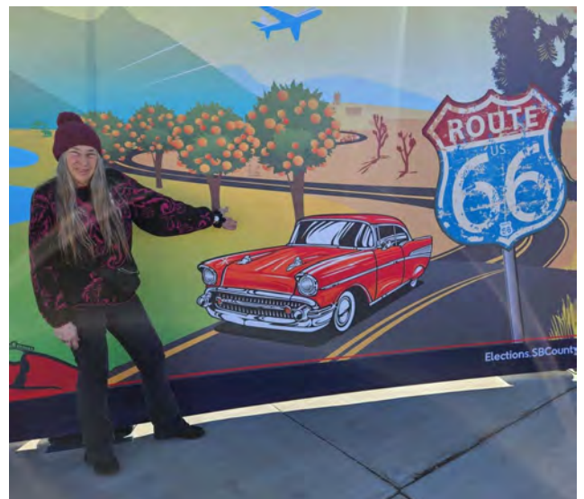
San Bernardino county celebrates Route 66.