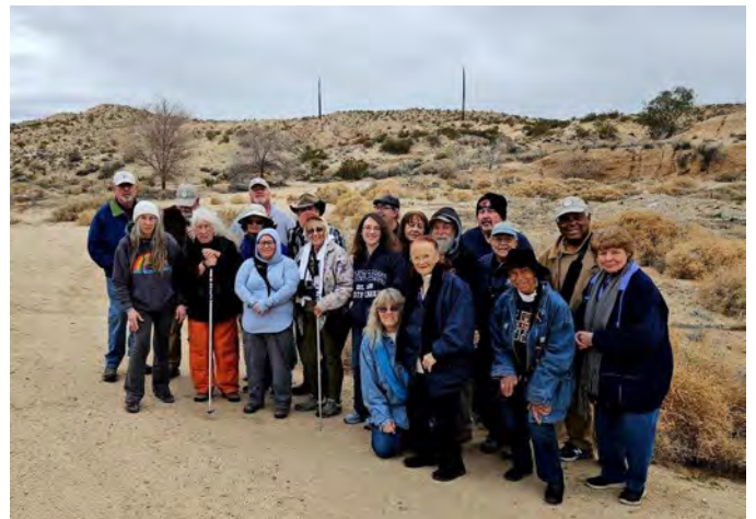
Attendees posing with the 2 100-ft tall flagpoles in the background

We are grateful to the Mojave Desert Land Trust employees and volunteers who work hard to preserve this beautiful area and many other properties, for the plants and animals that call them home, and for future generations of human beings to explore and enjoy.