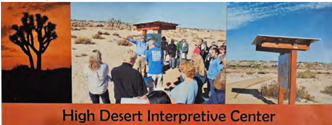
High Desert Interpretive Center

The Saturday February 24 fieldtrip will take us to the High Desert Interpretive Center, under the jurisdiction of the Mojave Water Agency. The center is located between the Mojave River and Deep Creek Rd. in Apple Valley, with the entrance at 7620 Deep Creek Road. We will meet at 10 AM at the covered amphitheater, and then walk the 1000 foot instructional paths with interpretive kiosks, to increase our knowledge of the Mojave's natural and cultural history. We will learn about our region's biological resources and water history, as well as the Serrano and Vanyume Native Americans who lived on the land.