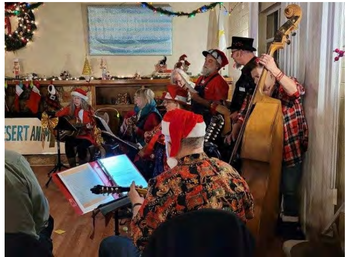
The High Desert Jammers leading the sing-along at the Christmas party.

Upon occasion we also hear from Wrightwood, Lucerne Valley, and others.