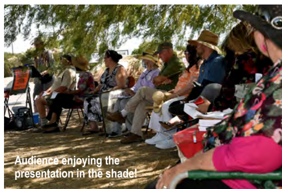
Audience enjoying the presentation in the shade!