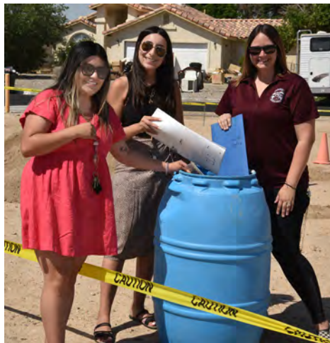
Helendale Elementary 5th grade teachers placing the posters which were designed by the current 5th Graders into the Time Capsule.