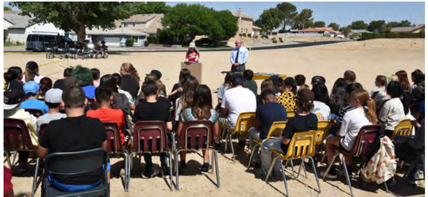
Helendale Elementary 5th grade classes