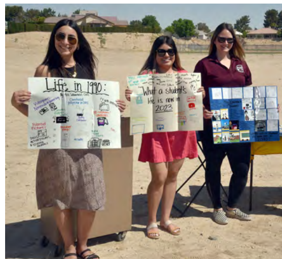
Helendale Elementary 5th grade teachers sharing the "Life in 1990", "Life in 2023" and "Predictions for 2090" posters which were designed by the current 5th Graders to be placed in the time capsule.