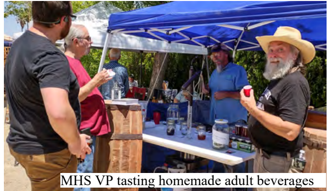
MHS VP tasting homemade adult beverages