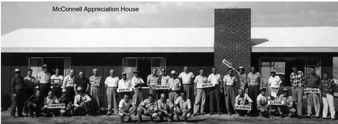
McConnell Appreciation House