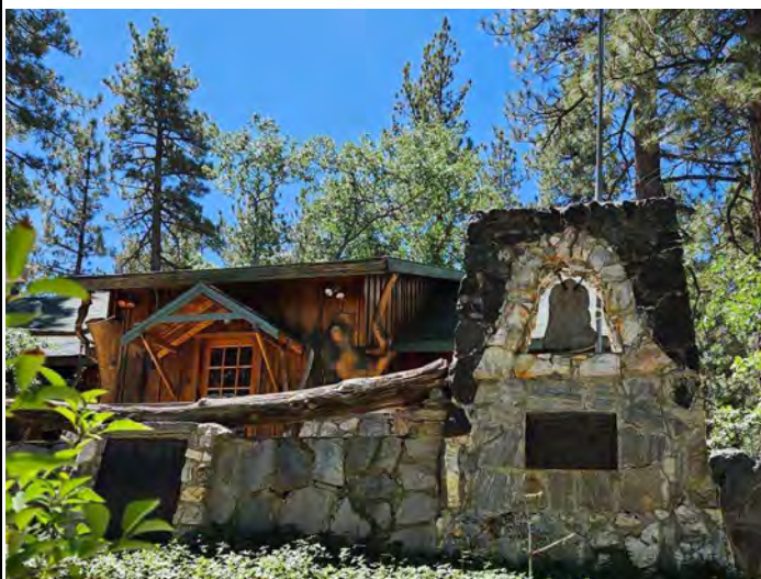
Historic Acorn Lodge

stop, a little seating area, directly across from the Big Pines Recreation hall which we visited last year. He shared the history of the area, a top winter vacation spot for Angelinos and other 'down-the-hillers' from the roaring 20's on, where people came for ice skating, sledding, and snowshoeing, as well as sitting around the campfire at the natural amphitheater to enjoy beautiful days and nights in a mountain winter wonderland! We were provided with a map, showing the location of these early recreation sites and the nearby Smithsonian Observatory.