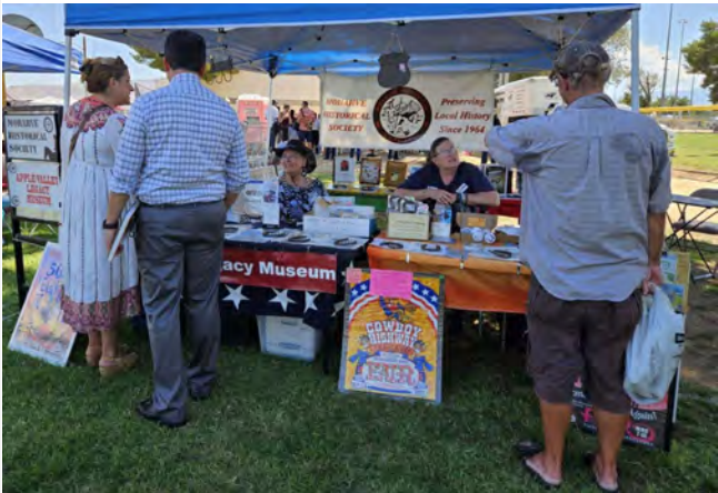
MHS members man the booth at the Apple Valley Village Street Fair at James Woody Park following the Happy Trails Parade Sept 9.