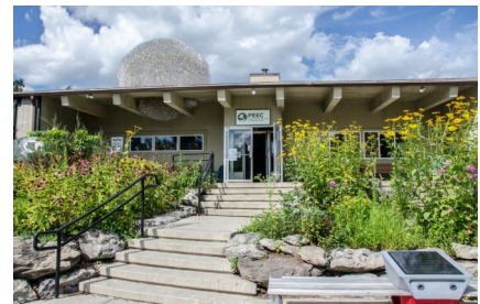
Pocono Environmental Education Center (PEEC) https://www.peec.org/