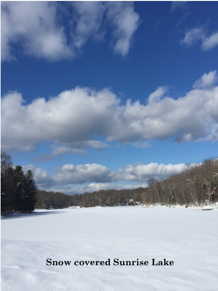
Snow covered Sunrise Lake