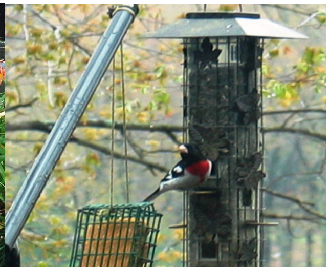
The Rose-Breasted Grosbeaks come in May.