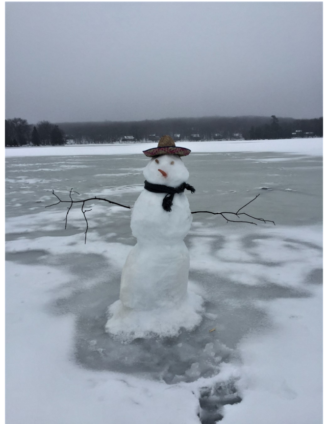
Ice fisher created snowman (I went out and decorated it)