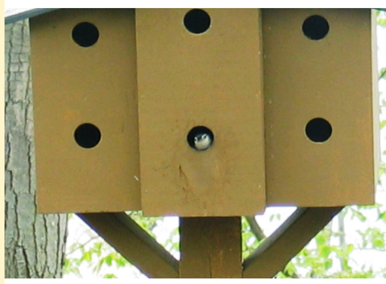
Nuthatches start nesting in late April to early May