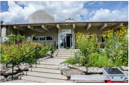
Pocono Environmental Education Center (PEEC) https://www.peec.org/