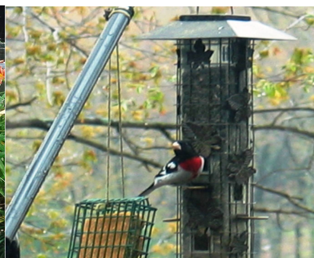
The Rose-Breasted Grosbeaks come in May.