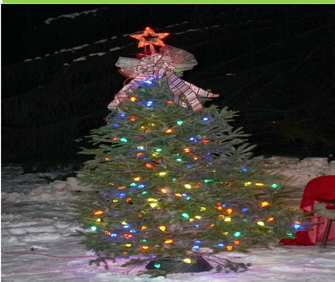
Oh Christmas Tree, Oh Christmas Tree