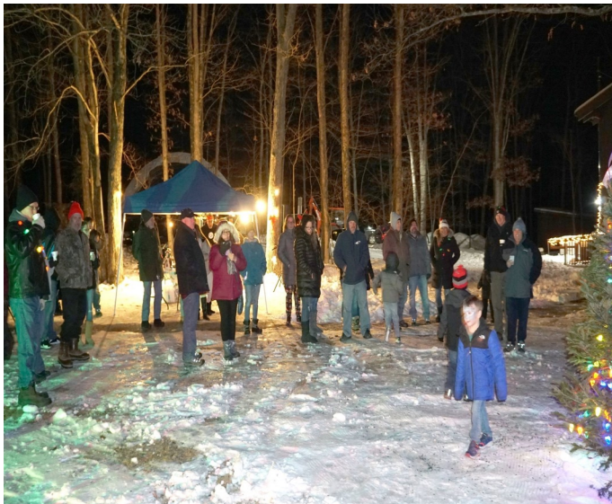
The crowd anxiously awaiting Santa's arrival.

Last, but not least, we cannot forget the rest of the awesome team that makes up the Events Committee.