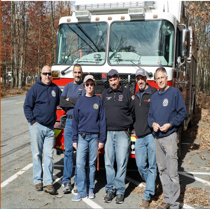
The Fire Company joined in for photo ops and handed out candy