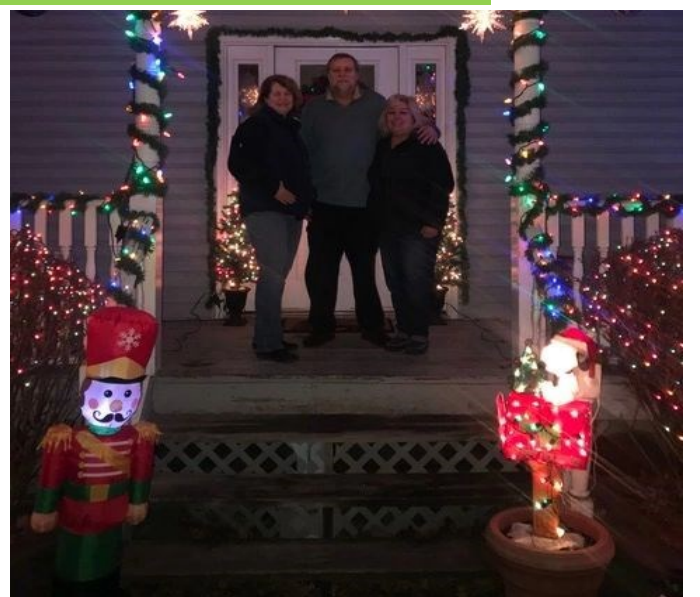
Most colors/lights: Major Family, 206 Spruce Lake Drive.