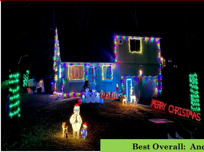
Best Overall: Andres, 100 Fairview