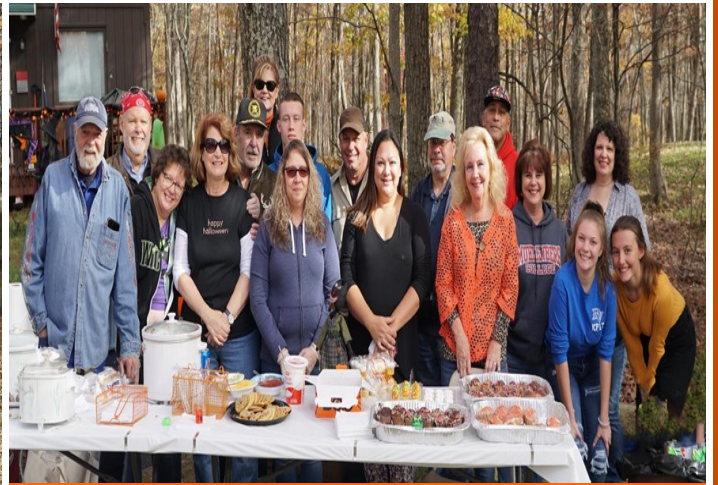
Special thanks to the SLPOA Events Committee, Office Staff and Event Volunteers!