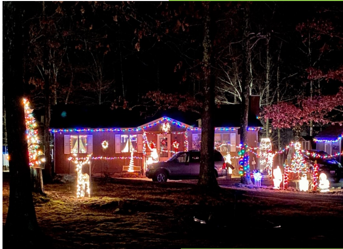
Most Creative: Kolb family 207 Spruce Lake Drive