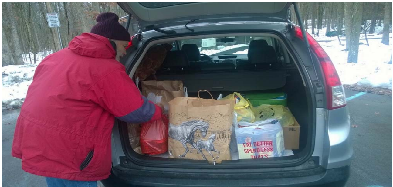
Jon Westock loading all of the pantry items.