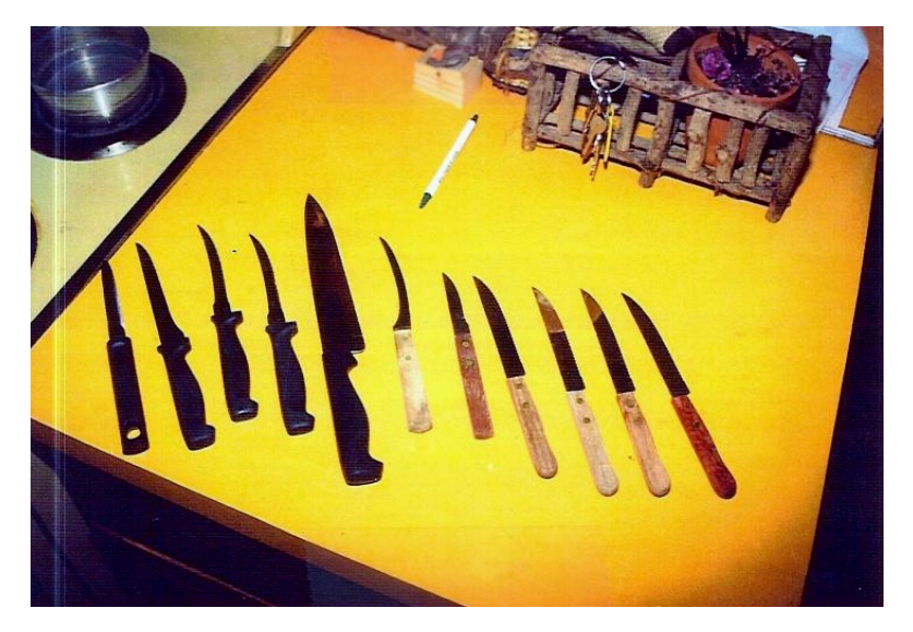
Two sets of knives from the victim's kitchen. The one on the left is missing the butcher knife.