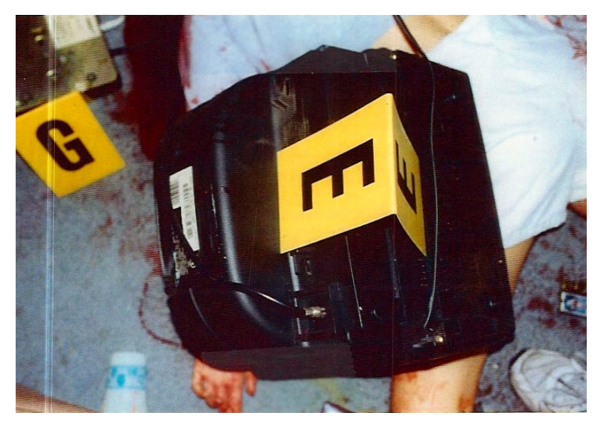
The policeman's foot making the footprint.