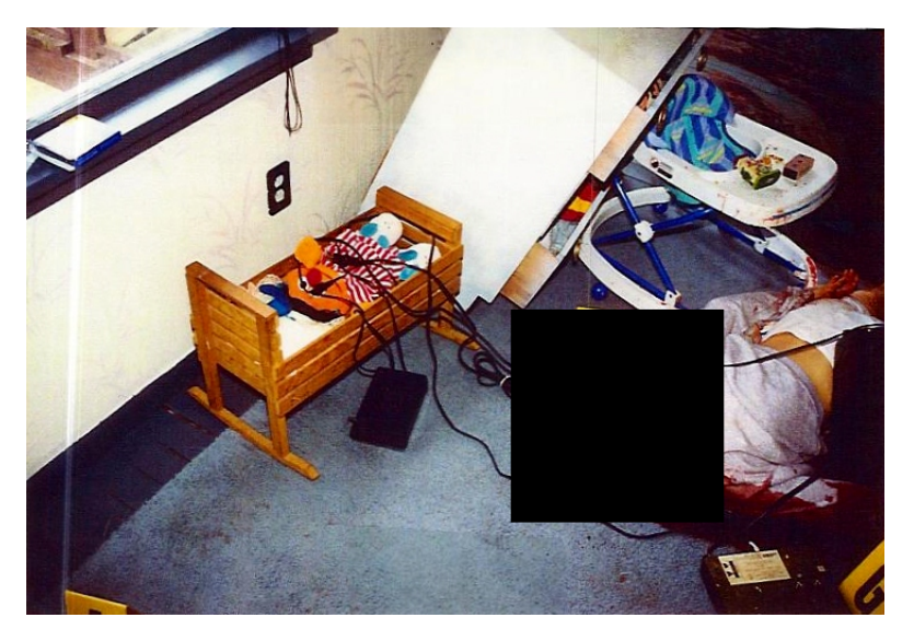
Instead of ripping from the outlet when objects fell from the chest of drawers, the cords were placed underneath the outlet.