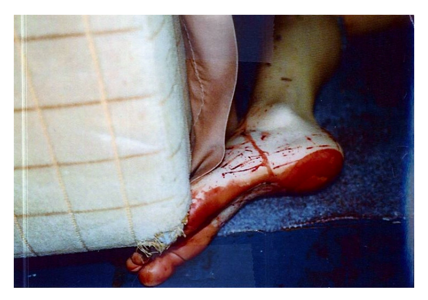
Blood staining on the victim's left foot that she made as she took her last step and slid through her own blood on the floor in front of her.