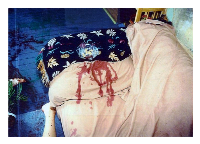
Prosecution's theory of where the fatal injury occurred.