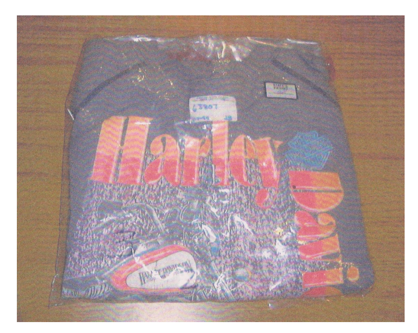
The Pittsburg Steeler's sweatshirt became a Harley Davidson sweatshirt before it made it to the lab. It had human blood on it. It was not the victim's.