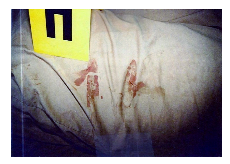
Knife swipes on pillow from right end of couch nearest the stairs.