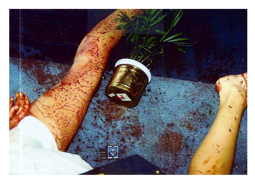
A bloody footprint. An unknown baby in a photo positioned between the victim's legs.