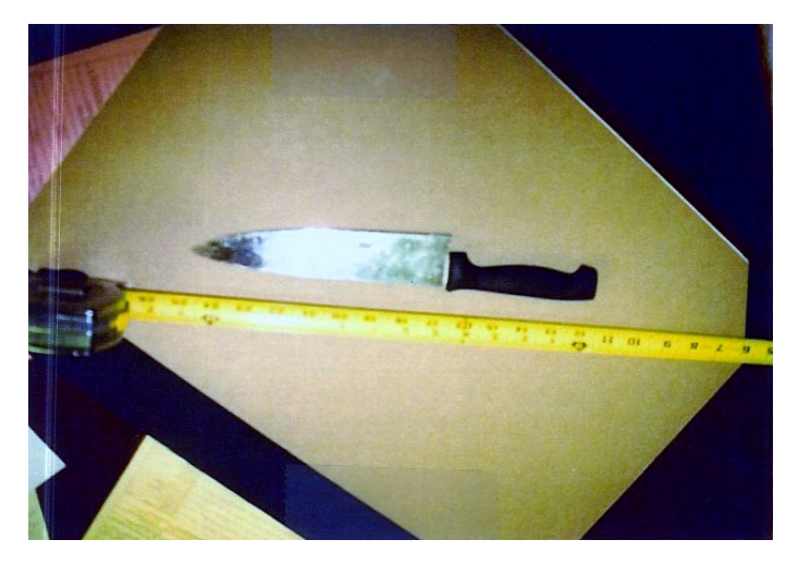
Kitchen knife with fingerprint.