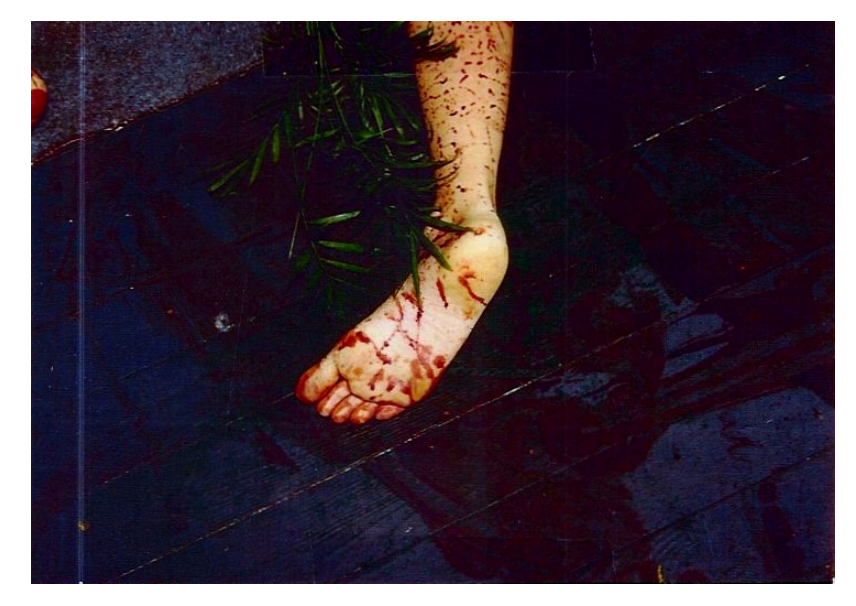
This foot flipped upside down and dragged through the blood as the victim's own blood dripped from the person of the killer onto the bottom of her foot.