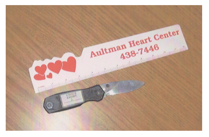
Shrade ('Joe's knife').