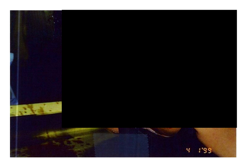
Unexplained abrasions from time of death.