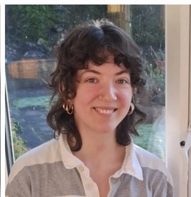
DULCIE Project Worker

Alongside what you see day-to-day, the team also works behind the scenes on: