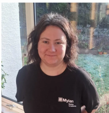
CAT Project Worker