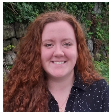
CATRIN Operations Lead