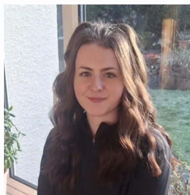
SHANN Project Worker