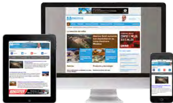
* Publishers own data

Articles will also be hosted indefinitely on Mineria-PA.com