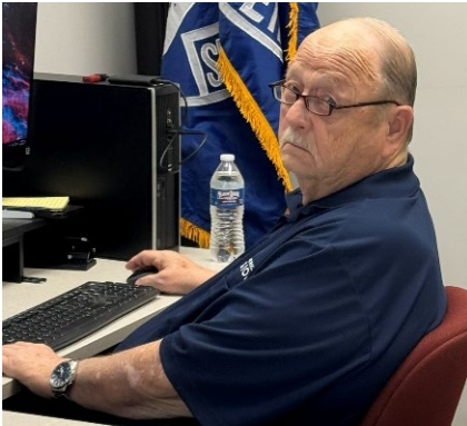
Non Sibi Sed Patriae

We chose to change the layout of our newsletter. We hope everyone finds this change to be a good fit. We hope our membership and veterans will renew/join Post 14. As you can see, all the programs our post is involved in are which is serving our community and the youth of veterans. Additionally, the scholarship committee received 16 applications. Among these, several made the choices difficult. The scholarships will be awarded in early March. We are involved with two of the county's JROTC programs, Red Bank and Central. Several Post 14 members are mentors in the Hamilton County Veteran Treatment Court. We're always seeking veteran mentors for this program. You can contact me at the phone number or email address below for more information about the opportunity to serve your fellow veterans.