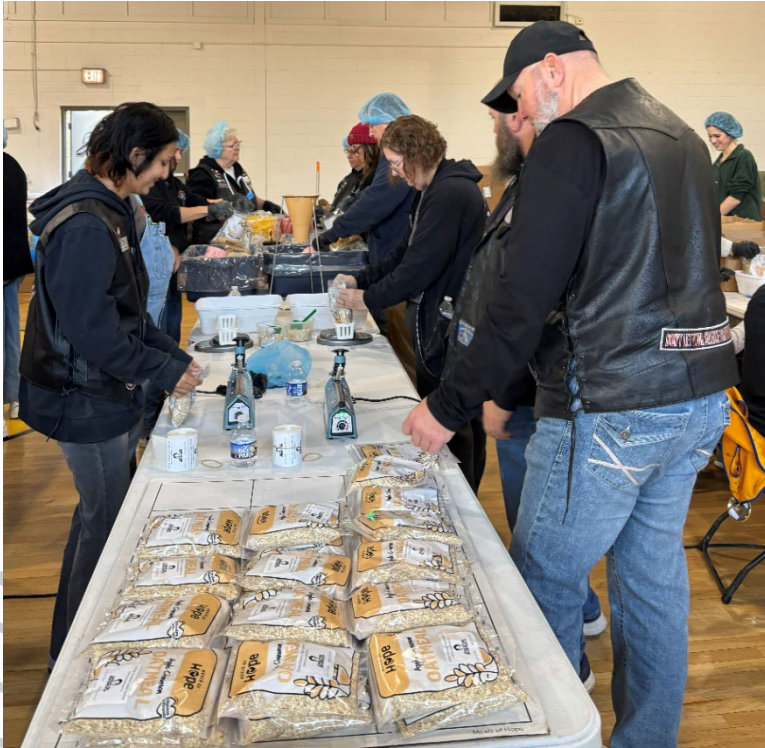
One of the ten assembly lines shows the number of people required to package the single-serve meals