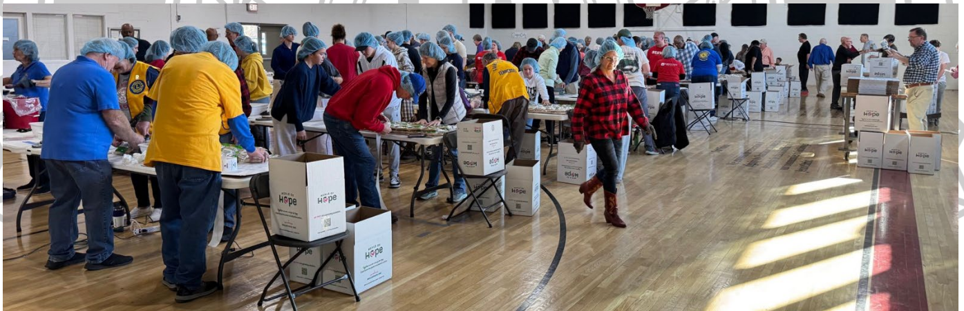
There were ten assembly lines. Henry Ford would be proud.