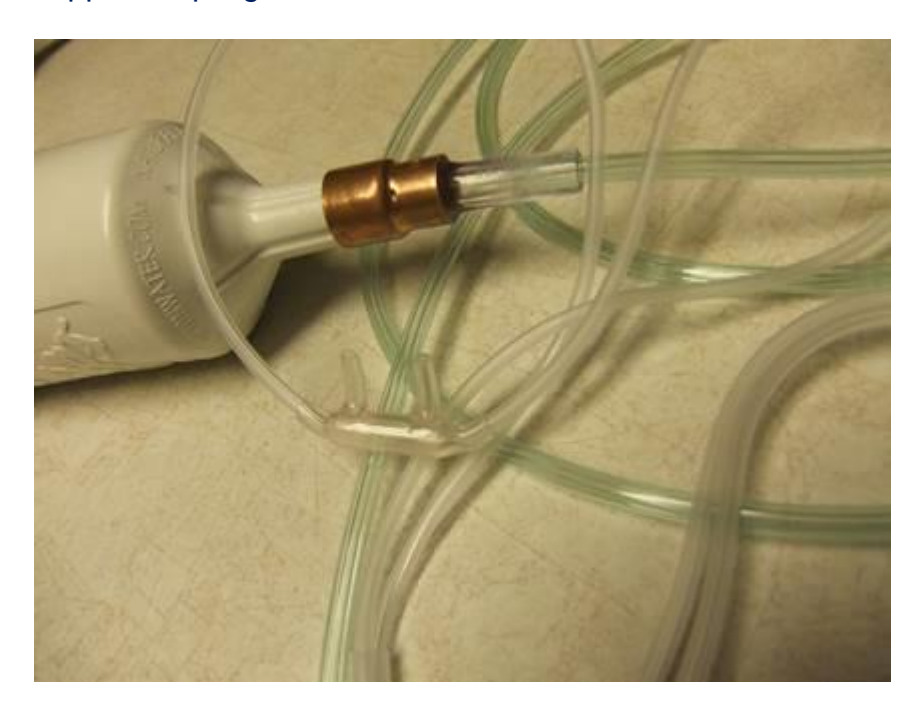
Here's the Nasal Cannula in the picture above: http://www.amazon.com/gp/product/B00881RIOE/ref=oh aui detailpage o03 s00?ie=UTF8&psc=1

For using a Nasal Cannula, attach the wide end of the tubing of the cannula (very short piece) to the copper coupling / structured water unit: