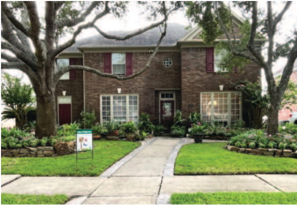
SEPTEMBER 1902 Lakewinds