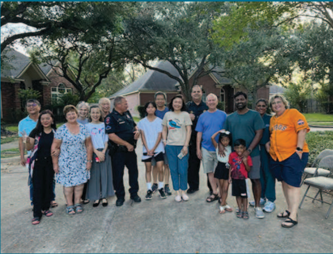
Block party residents gather from Westshore Drive & Court.