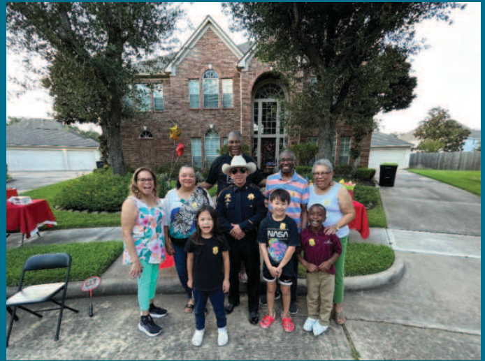
Starboard Shores Court residents celebrate National Night Out.