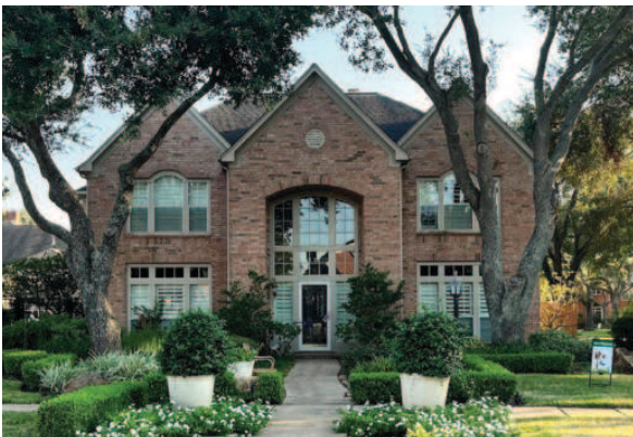
OCTOBER 4111 Waterview