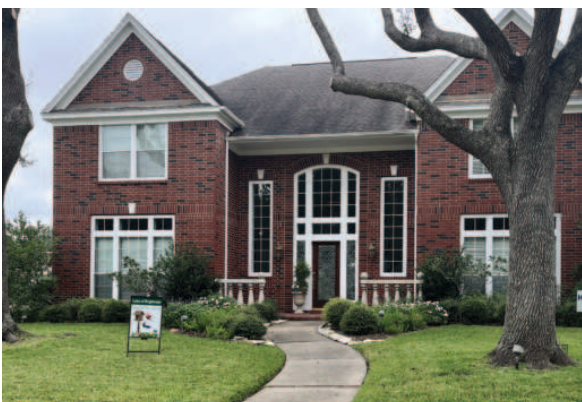
NOVEMBER 4127 Admiral Ct