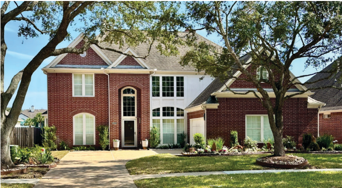
MARCH 1827 Lakefront Drive