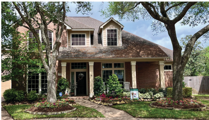
APRIL 4514 Anchor Point