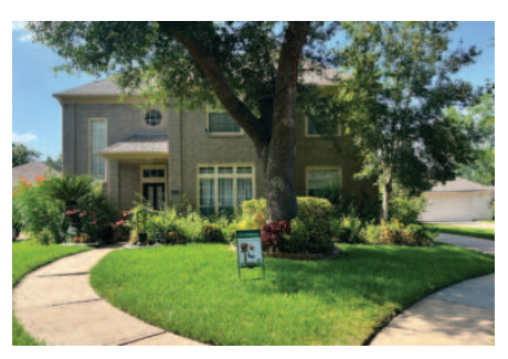
4110 Jetty Terrace Circle