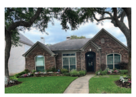
1711 Brightlake Way