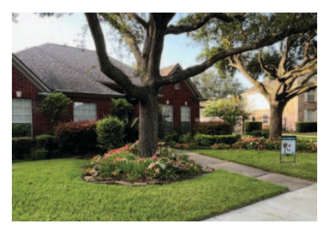
2206 Tradewinds Drive