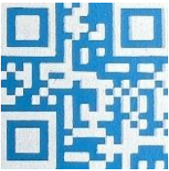
Victron QR Code

If applicable when using the SGT with the Bluetooth scan this QR code to access the Victron website for information on how to use the Bluetooth and download the phone app