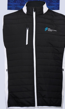
Gillet International Series