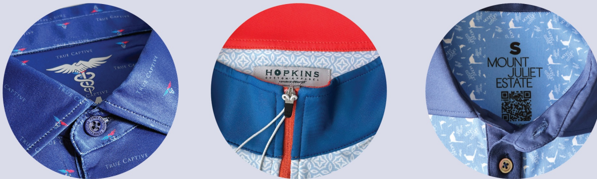
True Captive - Rubber Heat transfer

Available in woven, sublimation, or heat transfer for a seamless, professional finish.