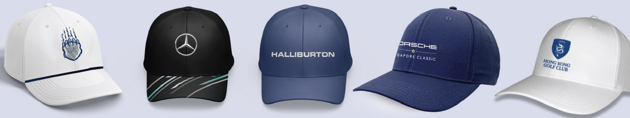
Cap 100% Polyester