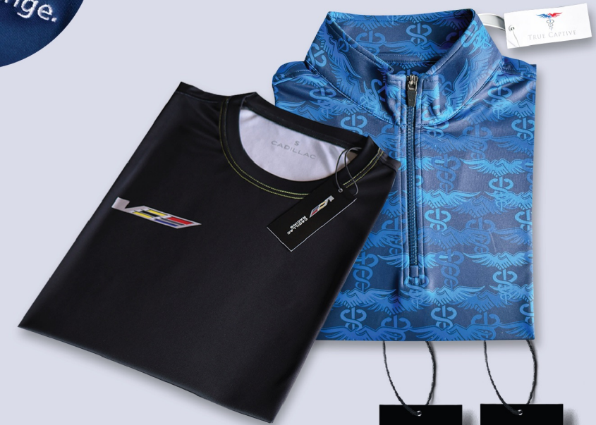
Mount Juliet Estate - Sublimation