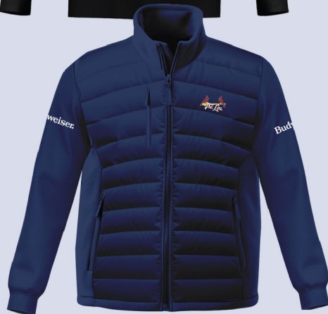
Long - Sleeve Gillet Budweiser