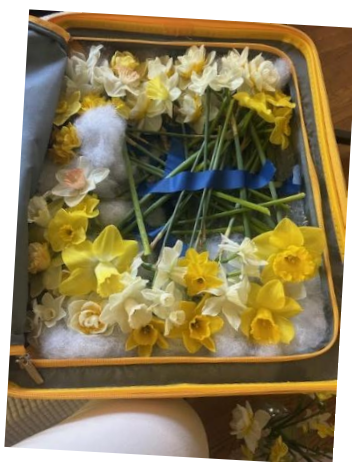
Packed up and ready to go!