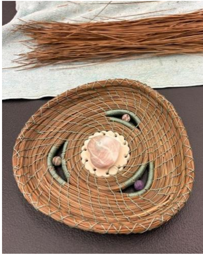
Carol's finely coiled pine needle weaving.