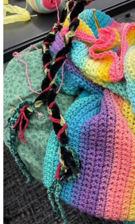
Heather's Holiday Tree & her rainbow crocheted Afghan. The long black & red marriage cord she made for friend. It was used for the hand fasting ceremony, the pagan version of a wedding.