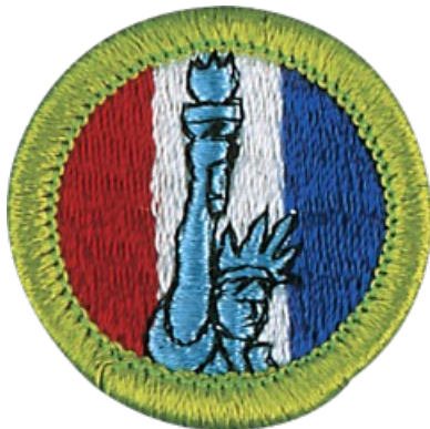
American Heritage Merit Badge