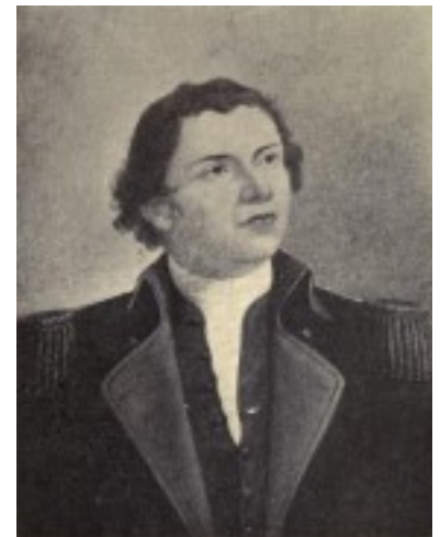
BG Hugh Mercer

Many Scots and Scots-Irish served with distinction throughout the Revolutionary War and made up substantial part of the Continental Army providing a good part of the leadership, such as William Lord Stirling Alexander, Hugh Mercer, Henry Knox, John Paul Jones, Alexander McDougall, Alexander Hamilton, Lachlan McIntosh, Richard Montgomery, John Morin Scott, Arthur St. Clair, George Rogers Clark, John Campbell and many of our Founding Fathers, George Ross, James Witherspoon, James Wilson, James McHenry and many others