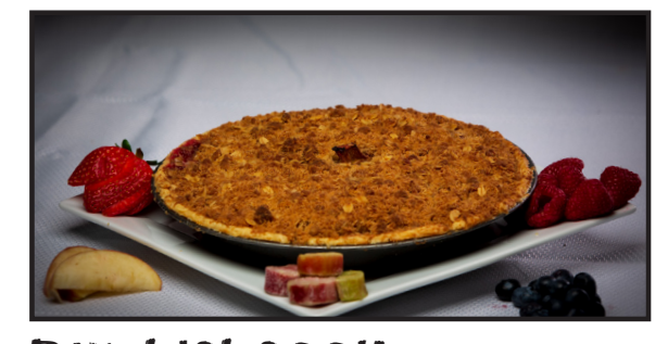
Bumbleberry - Bake & serve

Our signature pie has a little something for everyone... apples, strawberries, rhubarb, raspberries and Maine Wild blueberries, all topped off with our delicious oat crisp topping