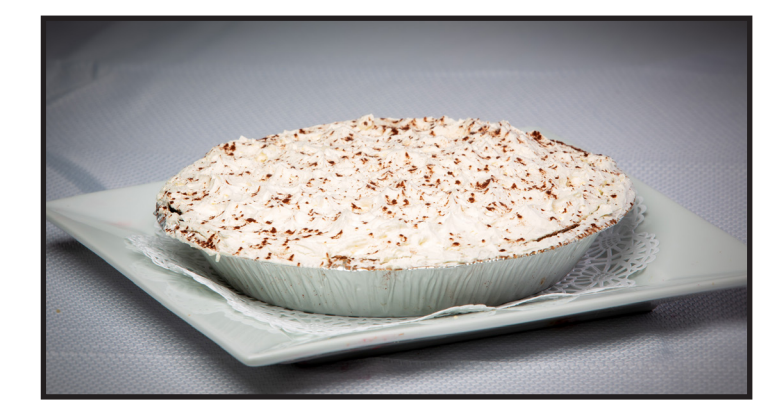
Chocolate French Silk

A traditional Southern Pecan Pie with a decadent, nutty, sweet filling smothered with pecans.