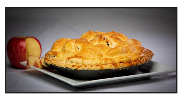
APPle Pie - Bake & Serve

Our signature pie has a little something for everyone... apples, strawberries, rhubarb, raspberries and Maine Wild blueberries, all topped off with our delicious oat crisp topping