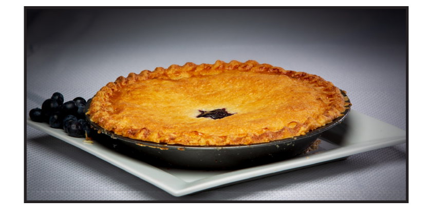
Maine Wild Blueberries may be small, but they are packed with big flavor in this popular pie.

No preservatives. Made locally here in Maine. www.valleyvieworchardpies.com