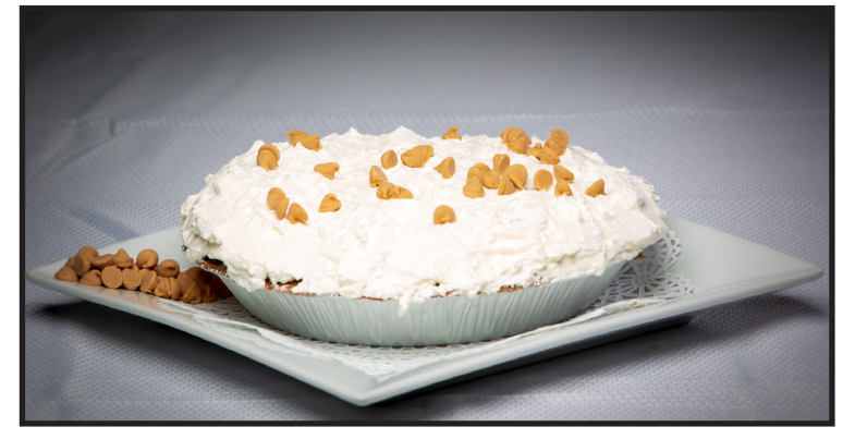
PEANUT BUTTER MOUSSE

Melt in your mouth dark, creamy chocolate filling in a chocolate cookie crust and finished with blended whipped topping made with real cream. A chocolate lovers dream!