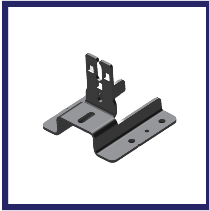
IR-D1 Multi-Surface Deck Mount Bracket