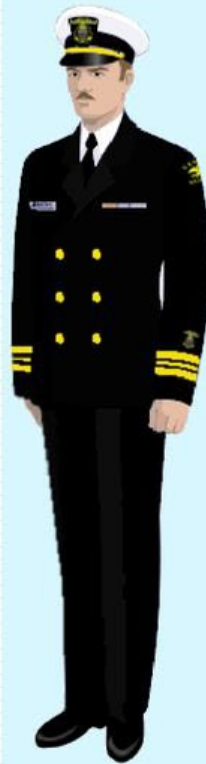
WINTER DRESS BLUES