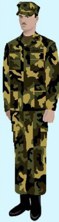
CAMOUFLAGE UTILITY UNIFORM (BDU's)