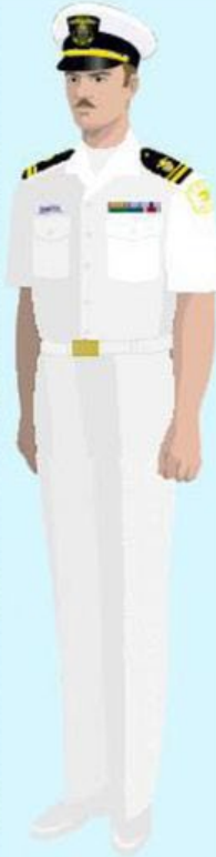
SUMMER DRESS WHITE