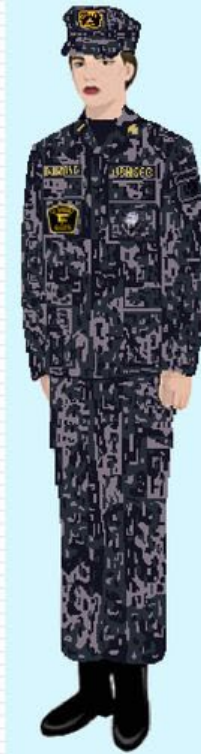
NAVY WORKING UNIFORM (NWU's) (BLUE BERRIES)