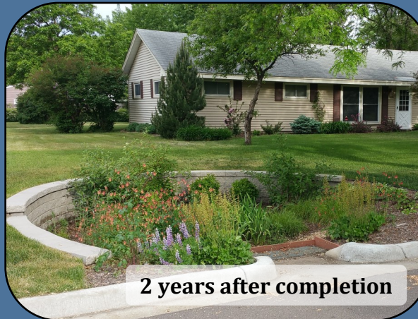
2 years after completion

Rain gardens are planted with native plants, which serve to enhance both the aesthetic and the ecological quality of your property.