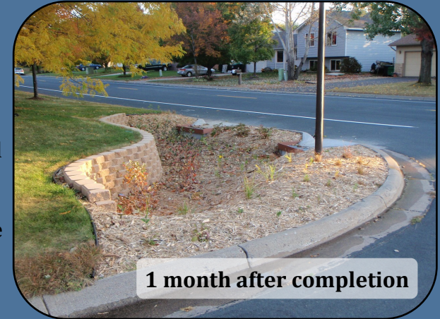
1 month after completion

A rain garden is a constructed shallow depression that captures stormwater runoff from the surrounding area and allows the stormwater to slowly infiltrate into the soil. Rain gardens reduce runoff volumes and filter pollutants.