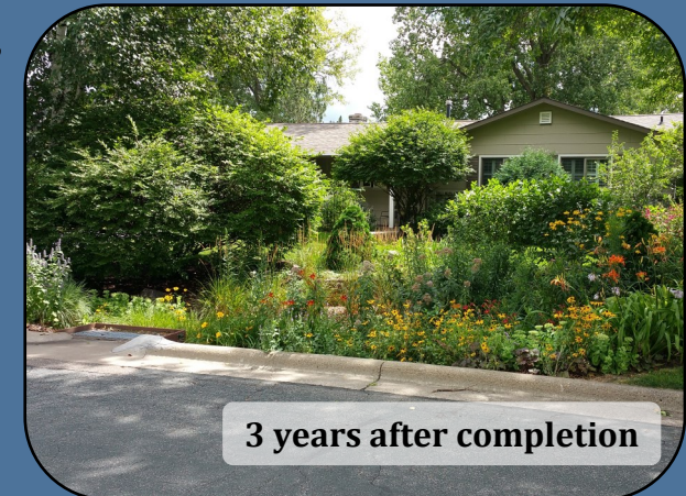
3 years after completion

For a curb-cut rain garden, a break is created in the curb to allow stormwater runoff from the street to enter the rain garden. Curb-cut rain gardens are fit with a Rain Guardian pre-treatment chamber to capture sediment and large debris from the street.