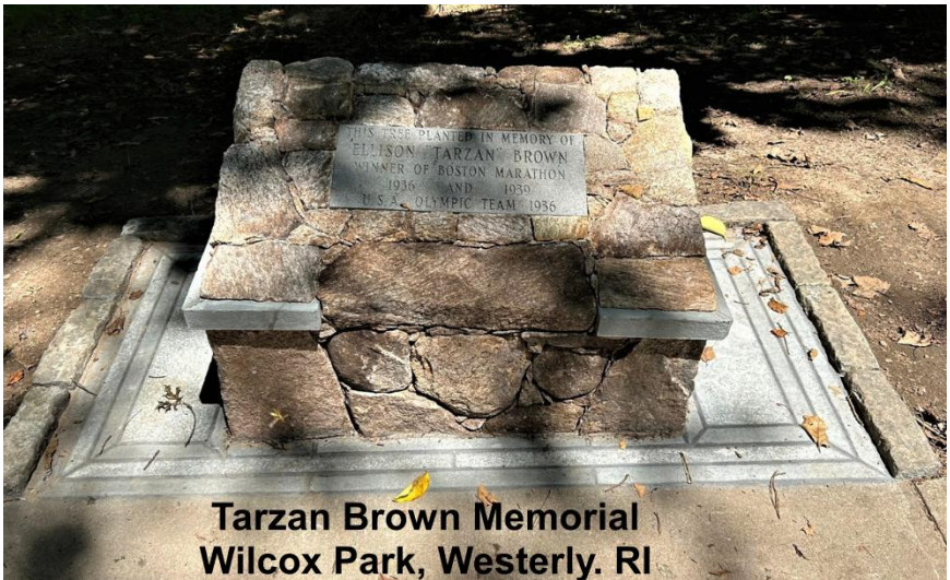
Tarzan Brown Memorial Wilcox Park, Westerly, RI