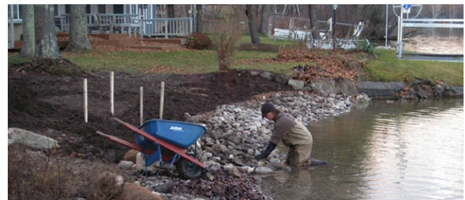
Biotechnical erosion control project being installed at a higher energy inland lake shoreline.