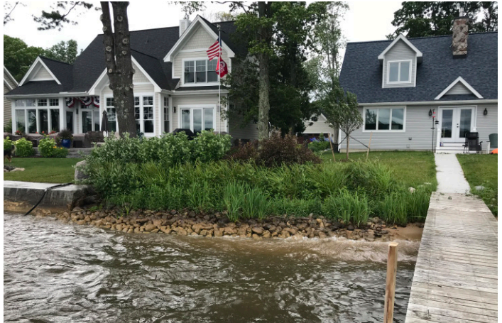
This bioengineering design protects the shoreline on this high energy lake by dissipating wave energy from wind and boats while still providing lake access and not impeding lake views.

The shallow-sloped fieldstone provides easy access to and from the water for frogs and turtles. Biotechnical erosion control also provides feeding habitat for fish, birds, butterflies, and other wildlife. This practice also deters property damaging geese!