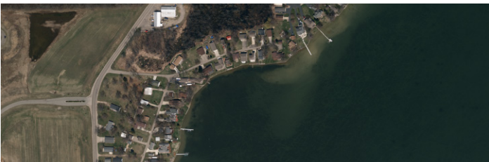
The pictures above compare the shoreline of a Michigan inland lake in 1938 (top) to the same shoreline in 2014 (bottom). Over-engineered shoreline stabilization (seawalls) are not only costly, they lead to poor lakeshore habitat.