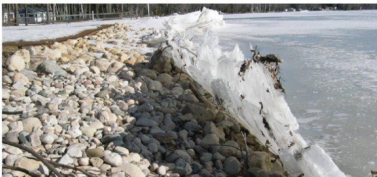
This higher-energy bioengineering project is protecting this shoreline from ice-push.